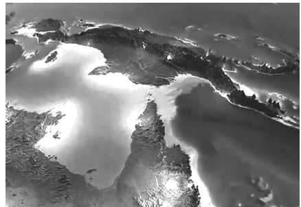
The Torres Strait is very narrow. (Simple present – stating a fact)